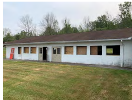
New windows and doors for the dining pavilion will allow a perfect view of the meadow across the road.