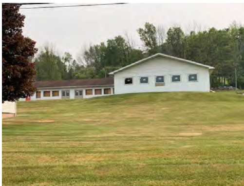
The dining pavilion facing Honesdale Road prepped and ready for a new facade.