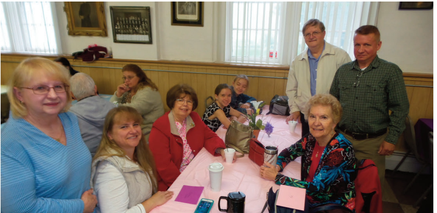
The Stasik Family celebrated Mother's Day together at Holy Cross Parish in Hamtramck, MI and enjoyed a continental breakfast.